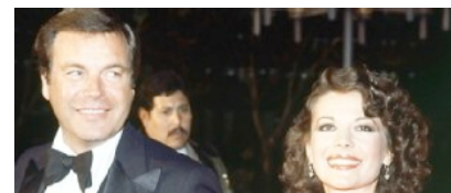
WATCH THE FULL EPISODE GMA: Natalie Wood Investigation Reopen