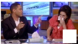
WNN Papers: Sick Calls Watch Video