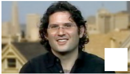
Keeping up Your Online Image Watch Video