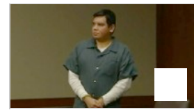
Clerical Error Frees Murder Suspect