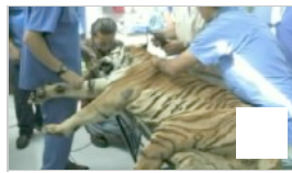
Stem Cell Treatment for Animals