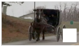
Man Dies in Amish Buggy Crash