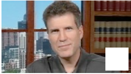
101 Weird Ways to Make Money Watch Video

New Trick In New York If you drive 25 mi/day or less you better read this... Insurance.Comparisons.Org